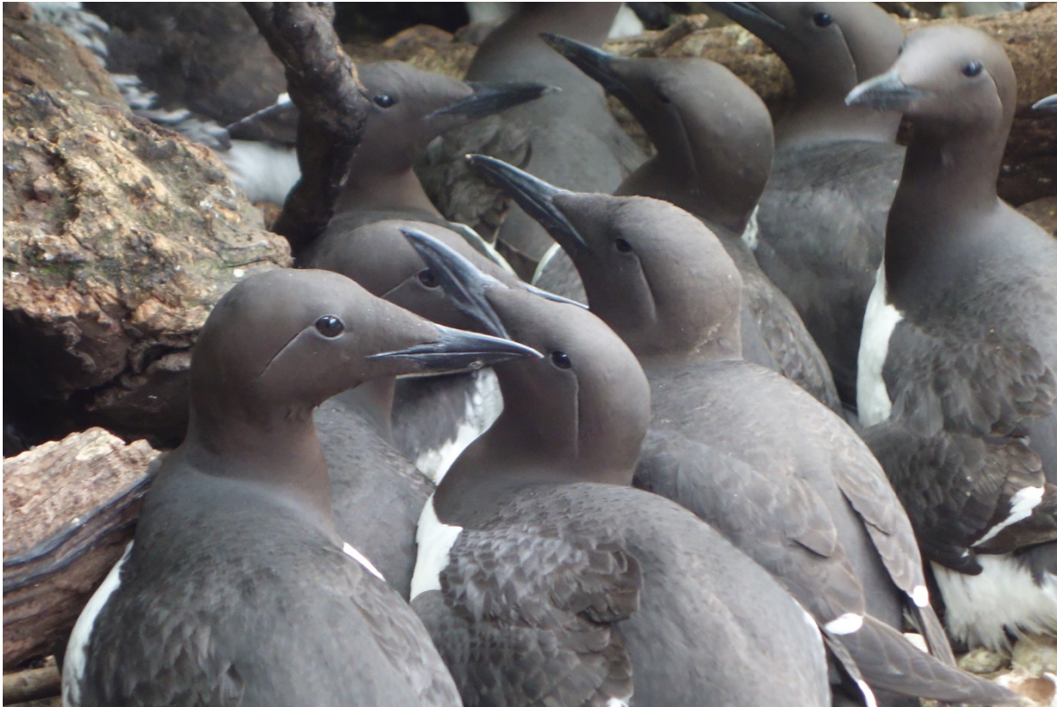
Figure 4. Common Murres nesting under the protective canopy of elderberry bushes on Duck Island.