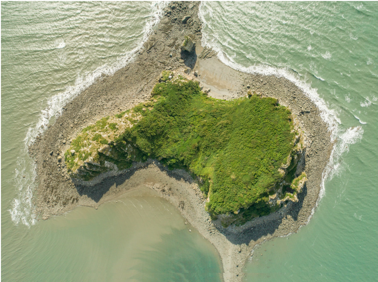
Figure 3: Overview photo of Duck Island.