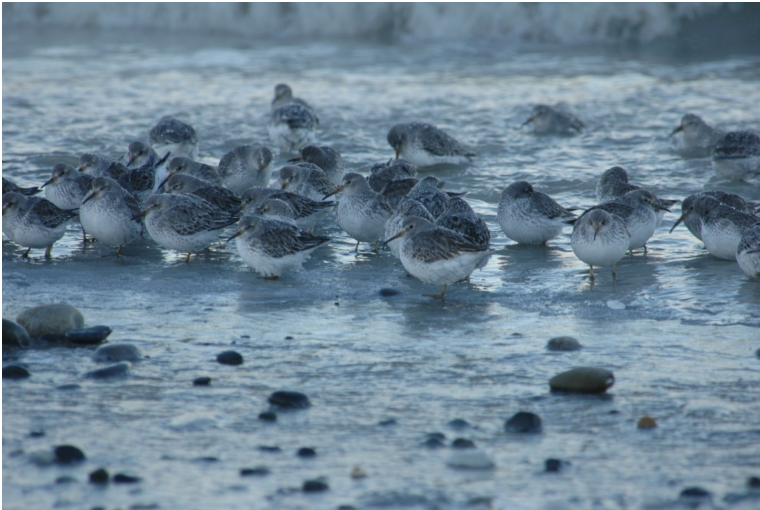
Figure two: Rock Sandpipers roosting along the icy shore of Cook Inlet.

International site (supports at least 100,000 shorebirds annually, or 10% of a species flyway population) for both Western Sandpipers and all shorebirds (Gill and Tibbitts 1999).